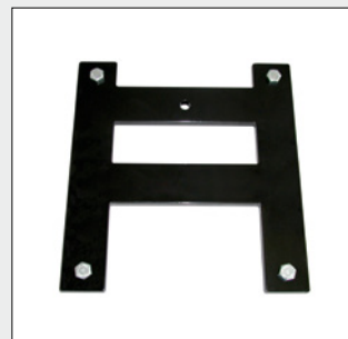
Spare wheel bracket for attaching the TendoMat® to an all-terrain vehicle.