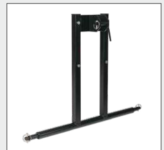
Three-Point-Frame CAT 0, CAT I, CAT II for attaching to the top and bottom links of the hydraulics.