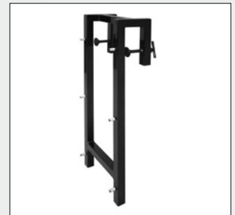
Holding device for tailboard for attaching to a vertical wall.