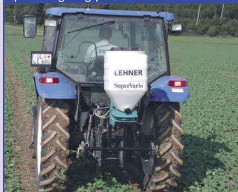
Spreading slug pellets