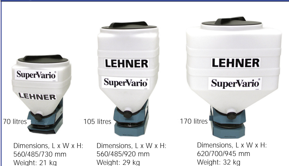
The SuperVario® models in various sizes