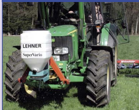
Grassland oversow and maintenance